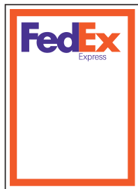
FedEx Clinical Pak